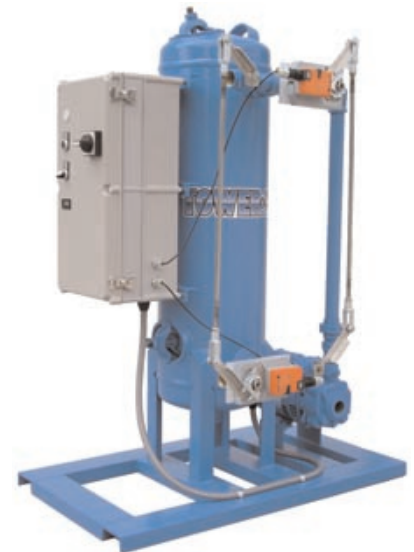
TFCL-12-Hi Pressure / Hi Temp system with pump