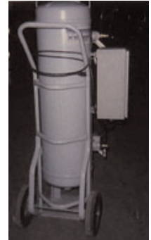
TFCL-12-Automatic-Portable-HITEMP filter system for 250°F water with "positive isolation" valve arrangement and custom control sequence with "cool down" cycle timer.

Solution: TFCL-12 or TFCL-20 filters mounted on two-wheel hand trucks or four wheel dollies, equipped for automatic or manual operation (automatic systems have a pigtail plug-in for 120V power supply to the control panel), and supplied with: